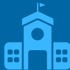
Wheatley EC Ward 5