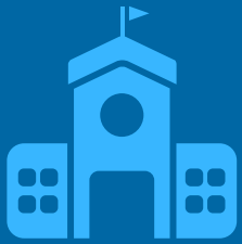
HD Woodson HS Ward 7