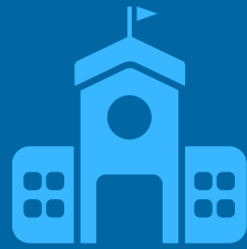
Walker-Jones EC Ward 6